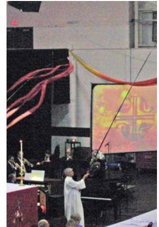
Colorful streamers whipped through the towering auditorium, declaring our time of worship.