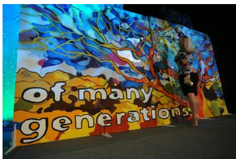
Mural of our paint-by-numbers efforts, overlaid with this beautifully illuminated picture of Christ