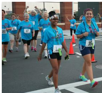
Team METRO DC raised $600!