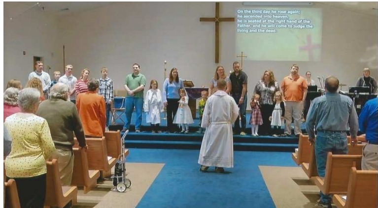
Good Samaritan in Lexington Park, a Journey participant, welcomes new members