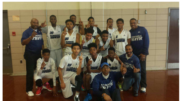
Youth basketball team from St. Michael's and Our Saviour's

St. Michael's Truth is one of our few African American worshipping communities in the synod. The initial grant that they received was to purchase hymnals and bibles for their congregation. We are also partnering with them in a new outreach effort in Temple Hills. The congregation of Our Saviour's in Temple Hills had declined to the point where they were