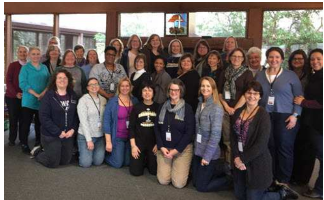
Women's ministry at Good Shepherd